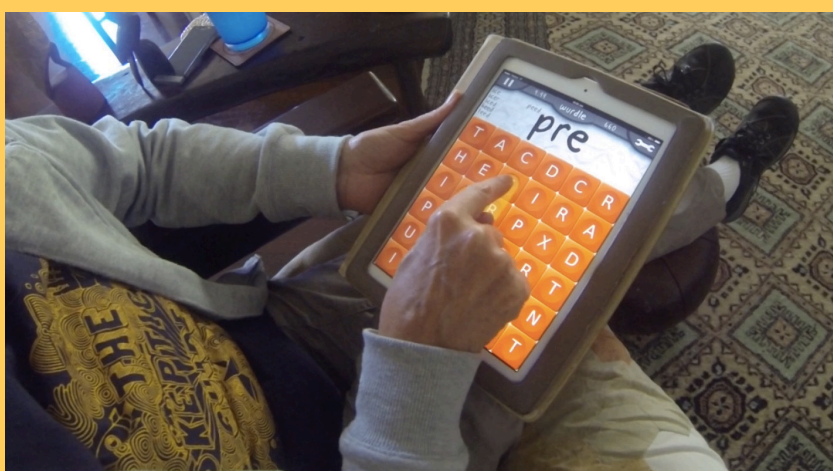
Figure 1: Understanding haptic (touch) screens and mobile games.

This study sought to take mobile games seriously as they expand across different public and private settings in ways that are social, ecological and even political. As mobile games move across different genres, platforms, practices and contexts , they become ever-present in our everyday lives, and for many of us, an important means of experiencing and navigating a digitally saturated world. They are also, significantly, conduits of what we call ambient play —a term that conveys how games and playful media practices have come to pervade much of our social and communicative terrain, both domestic and urban.